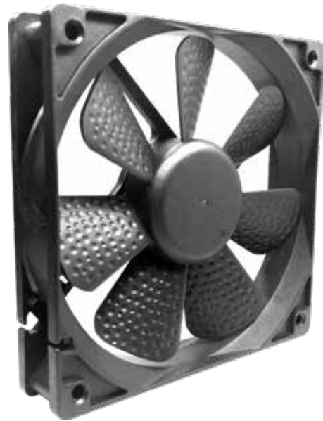
120x120x25mm DC Golf Fan P/Q Curves (At rated speed)